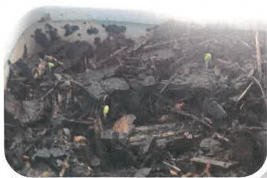
Basil seedlings just popping out of the soil.

The basil that Makayla and Dakota grew was successful. The soil in their pot had fertilizer. Each day they seem to be growing more. We learnt a lot about plants needing nutrients and the correct position for them to grow.