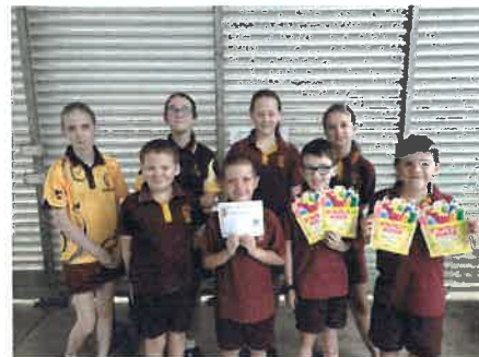
Students with 100% correct for last Friday's Spelling tests. Well done!